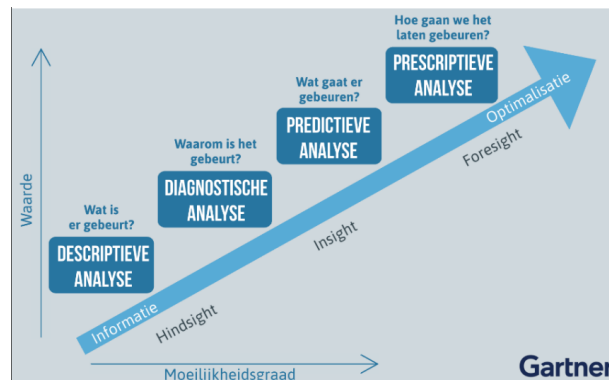
The Analytics Maturity Model (Gartner, 2012)

What makes an organization data-driven? We speak of a data-driven organization when decisions are made purely on the basis of data and algorithms. The business processes and sometimes even decisions are (partly) automated. In other words, in a data-driven organization, data is central to decision making.